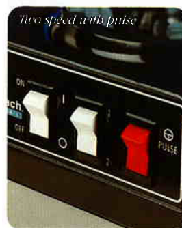
Two speed with pulse

A two year warranty provides protection that only the best can offer.