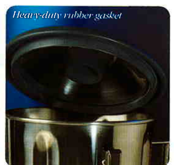
Heavy-duty rubber gasket