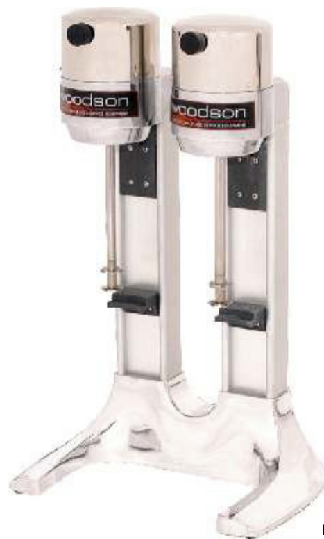
Model WMSB02V shown

Power Supply located on back right hand side of each benchtop unit